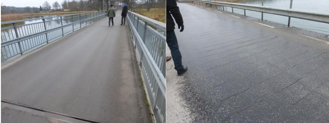
Figure 2 – Examples of bridges visited and cracking of wearing surface

The cracks in the wearing surface do not appear, however, to make the deck permeable to water, since it was seen that the superstructure under the visited bridge decks is not affected by corrosion. The membrane positioned at the base of the coating apparently remains intact.