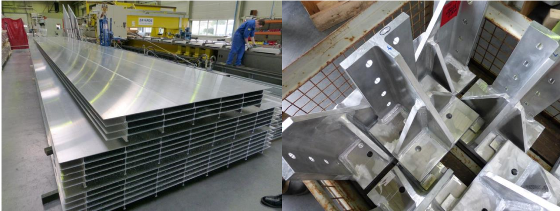
Figure 3 – Examples of friction stir welding and fusion welding by Bayards