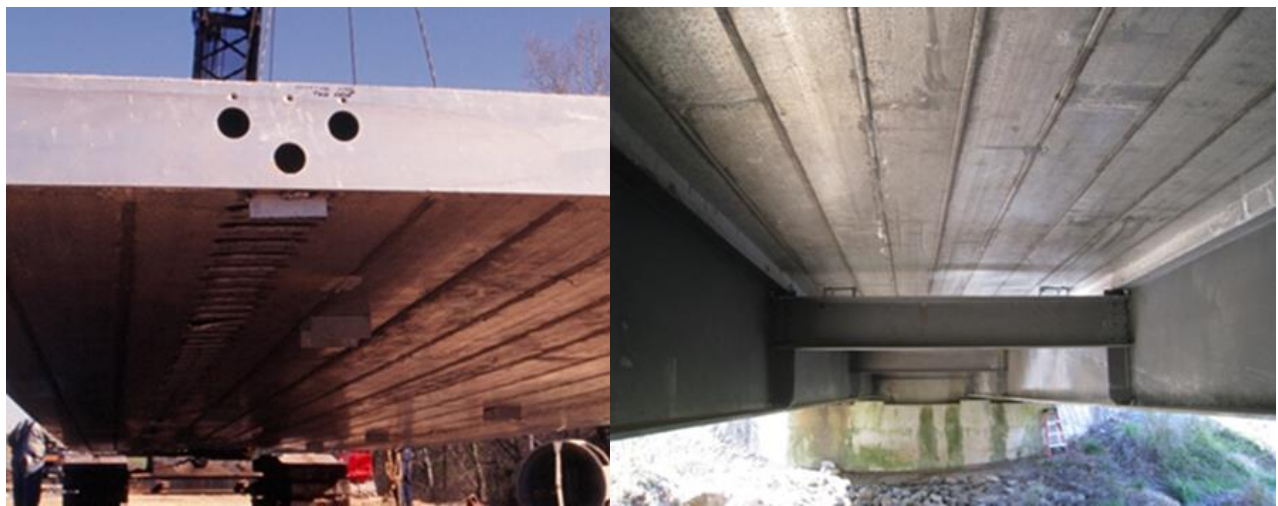
Figure 6 – Steel-aluminum composite bridge over the Little Buffalo Creek , in Virginia