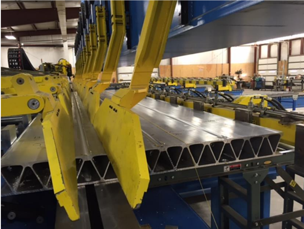
Figure 5 – Friction stir welded 5 inch bridge deck

A research program was set up with support from the Florida Department of Transportation (FDOT) to test the new 5 inch deck to allow accreditation for the replacement of steel deck grating on many mobile bridges in Florida. Aluminum deck, with an equivalent weight to the deck grating it replaces, was selected as the best option after considering several alternatives. It is this process that is currently underway in Florida under the supervision of George Patton.