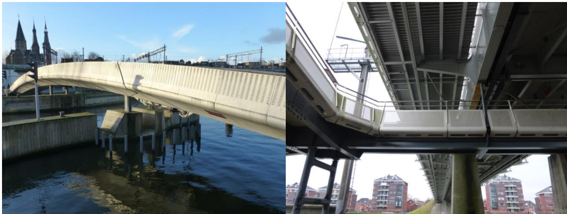
Figure 4 – Westerdok and Maarsen pedestrian bridges built by Bayards

Unlike the standard technology used by SAPA in Sweden, for the replacement of existing bridge decks with aluminum decks, the approach favoured by Bayards is more versatile and diverse. It can be applied both in the replacement of existing bridge decks and the construction of new road and pedestrian bridges made entirely of aluminum. The concepts and profiles used for the various structures are tailored to customer needs. In addition, Bayards promotes the involvement of an architect in the design of the bridge. This results in significantly more attractive structures than those designed by engineers alone for which the main concern is often promoting the lowest bidder.